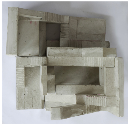
Image 02: Exhibit Model View from above of all the four pieces Concrete