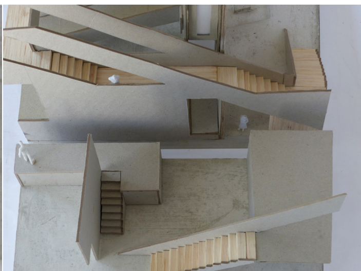
Image 04: Sectional Model 'Public' and 'Private' sections standing apart