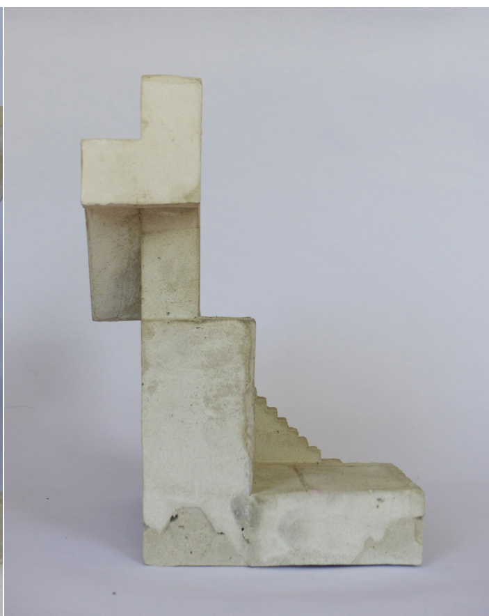
Image 06: Exhibit Model Individual piece - sculptural and interesting in its own right