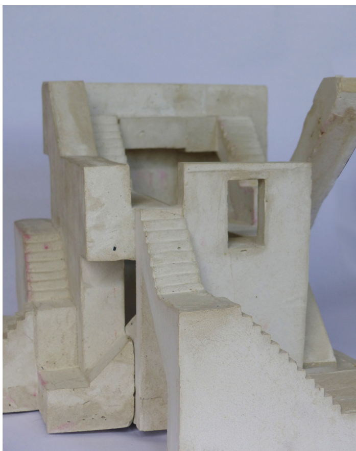
Image 05: Exhibit Model Connections between the pieces; bridges, ramps and steps